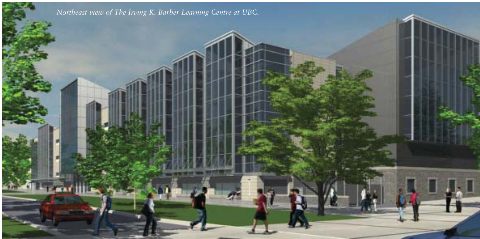
Northeast view of The Irving K. Barber Learning Centre at UBC.