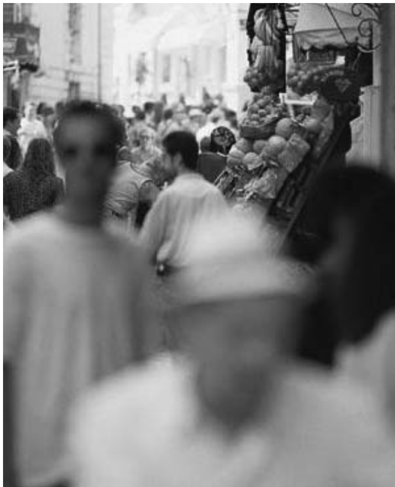
Ethnic votes were expected to greatly influence the June 28 federal election.

Thompson said labour legislation put in place in the early '90s making it considerably easier for unions to sign up members caused frustration in the business sector and the government is still trying to find a balance that is fair to both sides. □